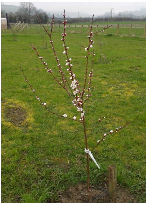
Apricot Goldcot in blossom

It looks like Spring has arrived at the orchard. We have the first blossom, an apricot, which really makes the spirits rise and the other trees are beginning to show buds breaking. Everything is springing into life after a few days of dry sunny and much warmer weather so it won't be long before everything is green and starting to grow strongly.